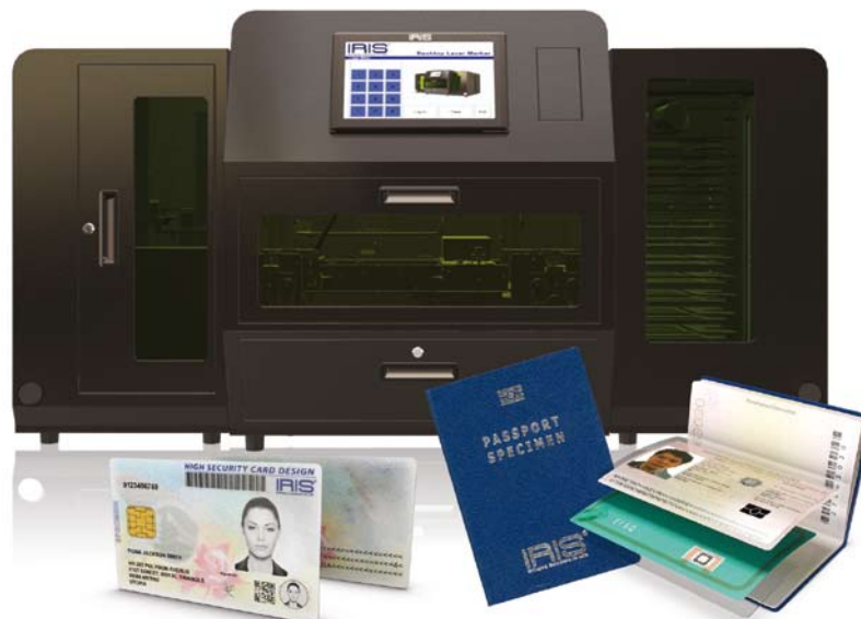
DLP400 – "World's First Multi e-Documents Smart Desktop Laser Marker"

IRIS Smart Technology Complex Technology Park Malaysia Bukit Jalil 57000 Kuala Lumpur, Malaysia